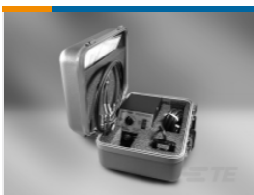
TE Part # 173643-000 RH-3960-1-TINEL-KIT-120V