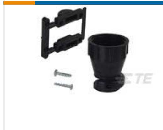
TE Part #206070-8 CABLE CLAMP KIT #17