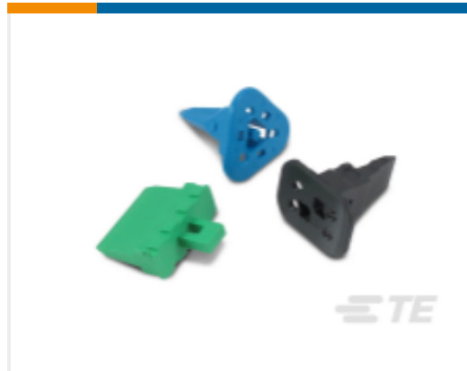
TE Part #W2S DEUTSCH DT WEDGELOCKS