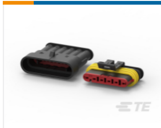
TE Part #282104-1 AMP SUPERSEAL 1.5MM, CONNECTOR HOUSING