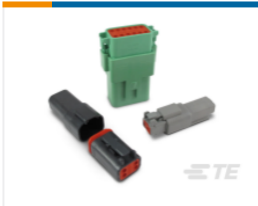
TE Part #DT04-2P DEUTSCH DT HOUSINGS