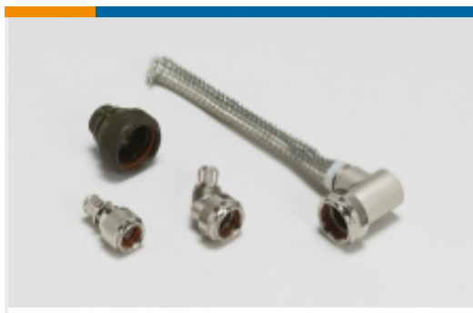
Ruggedized Backshells & Adapters (2071)