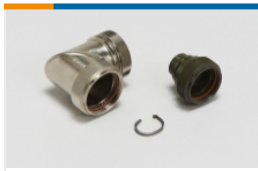
Screened Backshells & Adapters(1)