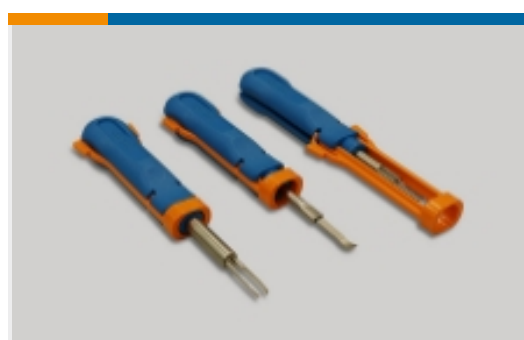
Insertion &amp; Extraction Tools(1)