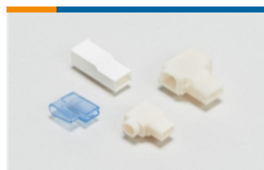
Crimp Terminal Housings(12)