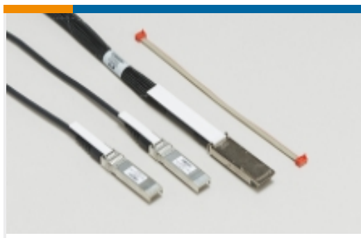
Pluggable I/O Cable Assemblies(81)