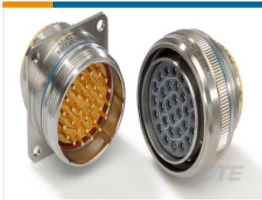
TE Part #ZPF000000000008805 983-6SE 12-12 S6 L