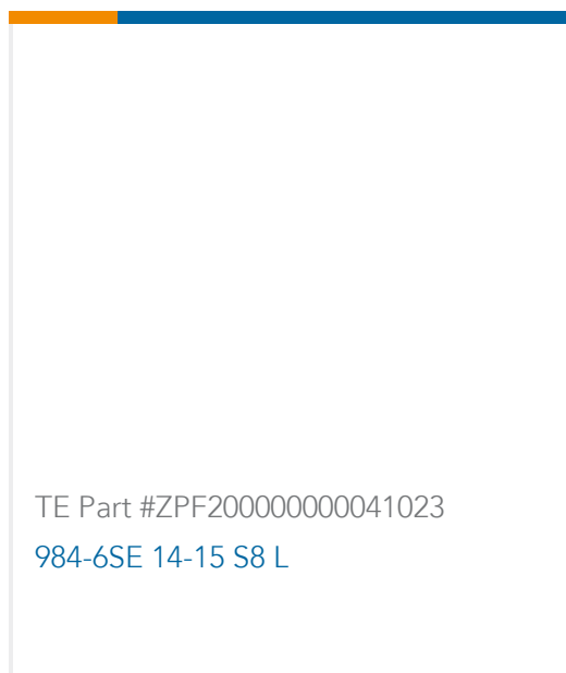
TE Part #ZPF2000000000041023 984-6SE 14-15 S8 L