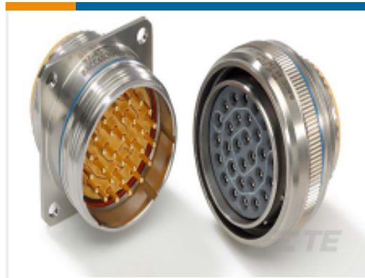
TE Part #ZPF000000000007545 983-0SE 12-12 S7 L