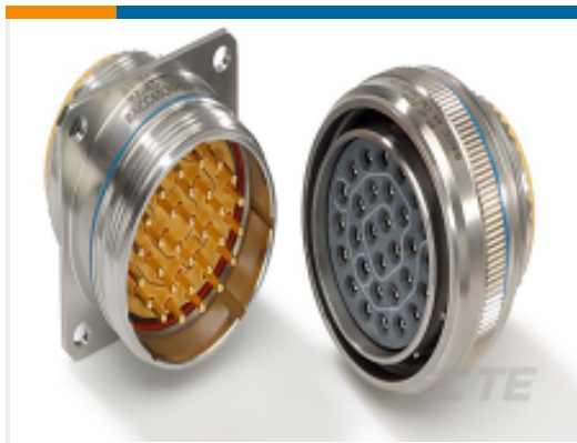
TE Part #ZPF200000000008792 983-6SE 12-03 SN-L