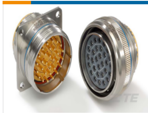
TE Part #ZPF000000000097806 983-15 KV 4-10-05 PN-L