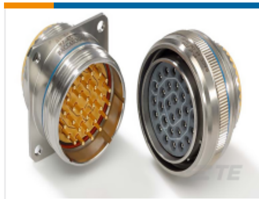
TE Part #ZPF000000000008859 983-6SE 14-15 PN-L