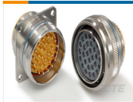
TE Part #ZPF000000000007966 983-15 KV 7-22-19 SN-L